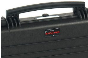
LARGE FRONT HANDLE

Internal slots for optional panel mounting brackets or panel mounting rings