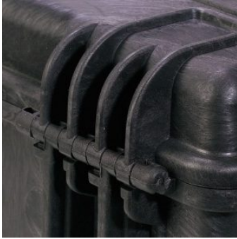
CORROSION PROOF METAL HINGES WITH LID STAY FEATURES