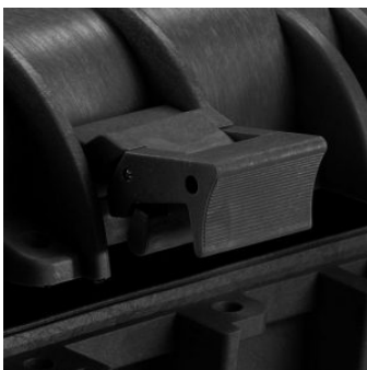
JAM FREE LATCHES WITH EASY-OPENING MECHANISM