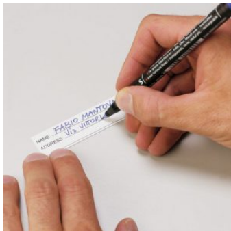
PVC WATERPROOF I. D. REMOVABLE LABEL (Art. LABELCOVER + nr. art.)