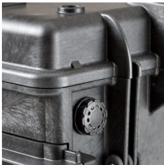
AUTOMATIC PURGE VALVE Automatic pressure release valve.