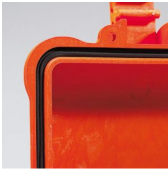
SEALING O-RING (Art. NEOSEAL + nr. art.)