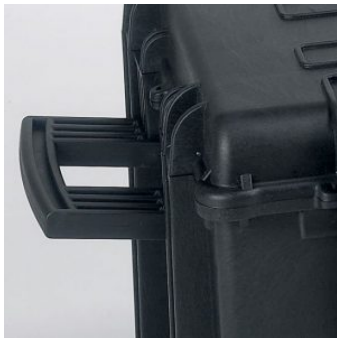
TWO MAN LIFT SIDE HANDLES