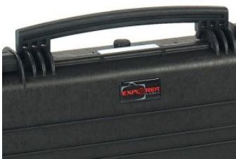
LARGE FRONT HANDLE

Internal slots for optional panel mounting brackets or panel mounting rings