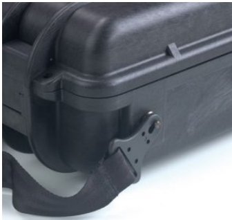
OPTIONAL SHOULDER STRAP (universal) (art. SHOULDERKIT.U)