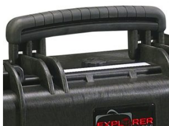
SOFT GRIP RUBBER HANDLE

Asa de carga comprobada, reforzada con pasadores de acero a prueba de corrosión